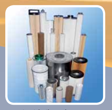
Liquid Filter Elements