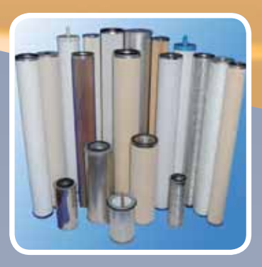
Gas Filter Elements